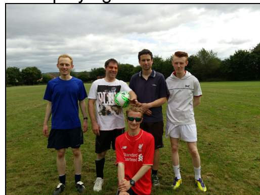
The team in August 2016

The team started in August last year with just 5 players and a "kickabout" on Upton Lane playing fields.